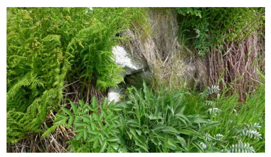
Rhenigidale hostel's luxuriant vegetation

The main problem is the Montbretia growing beside the steps up to the hostel. In Craigston valley in Barra it is beginning to take over now that the sheep can no longer graze it. It is a weed and the short flowering period in late summer does not justify it in any garden! I am trying to keep it under control in my garden but it is a battle but more of a contest than it is in Rhenigidale where it is still relatively well contained. I think digging it out (together with all the millions of small corms that form the rooting stock) would be the best start, then keeping it cut back when new plants appear, and/ or using 'Round up' until it dies out.