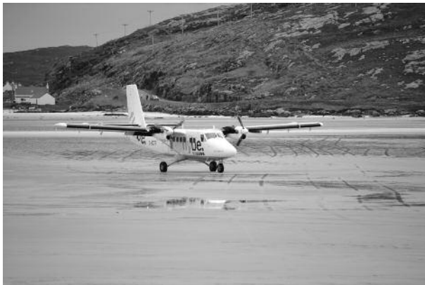
Barra's Traigh Mhòr is reputed to be the only beach runway in the world to handle scheduled airline services.

Garenin - a turning-point of destination rather than a stop of transition - is there on the W2 route - the West Side Circular. The clockwise journey from Stornoway takes in Callanish on the way there and so a bus journey from Garenin to the Stones would involve 'rocking around the clock' - so to speak. Plan ahead, with the timetable to hand.